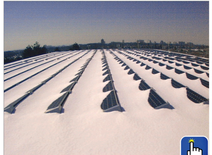
Date: Mar 07, 2014, Fri 12:59 PM Daily Energy: 89.6 kWh

SnoCam takes a photo each day at noon so you can check monthly output against local weather conditions.